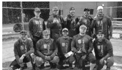
Men's Softball Champions

Starting Date: May 20 Time: 6:30 - 10:30 pm NEW Day: Tuesdays Location: Oakley Complex Early Registration: April 5 - 10 Cost $450 Registration: April 12 - May 15 Cost $475